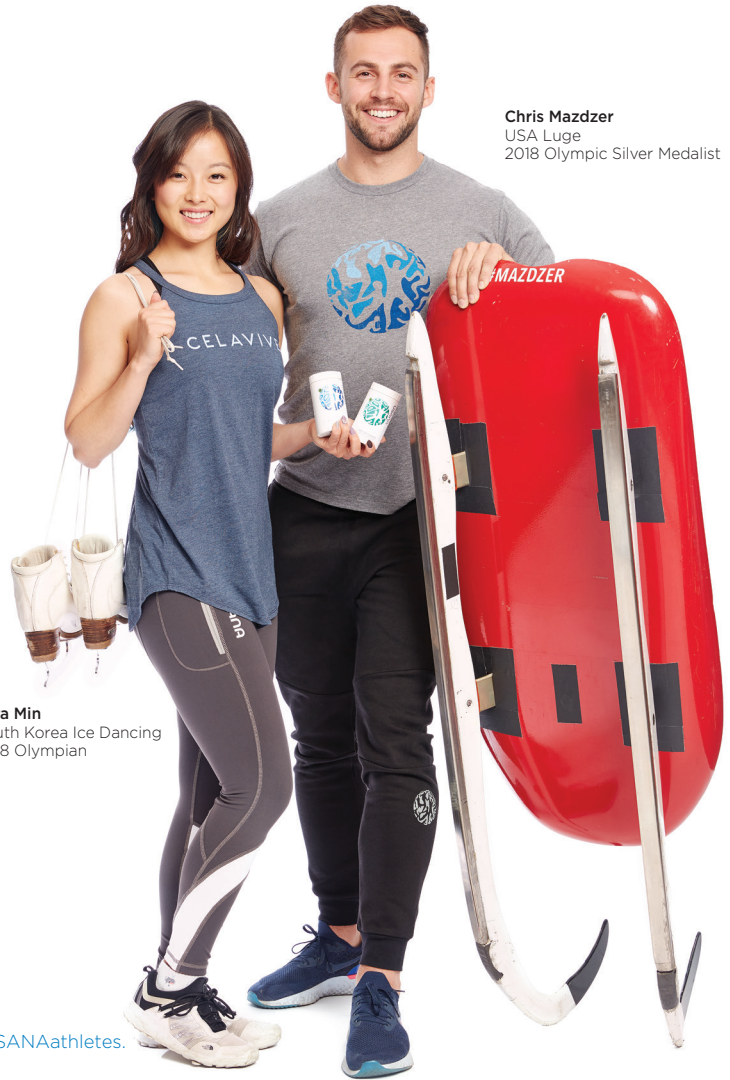
Chris Mazdzer USA Luge 2018 Olympic Silver Medalist

Follow USANA Athletes on Instagram @TeamUSANA @USANAathletes.